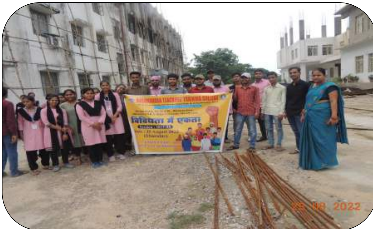
Students interacting with villagers during awareness rally programme on 25-08-2022

The rally encouraged active participation from the community, with villagers joining in the celebrations and sharing their thoughts on unity and diversity. Interactive sessions were held where community members discussed their cultural backgrounds and experiences, fostering a deeper understanding and appreciation of each other's heritage.