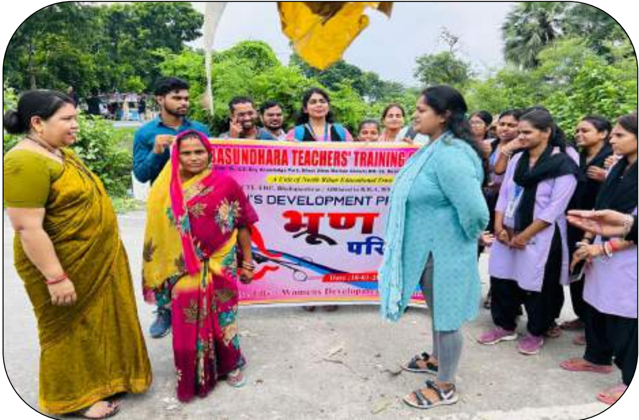
Students interacting with villagers during awareness rally programme on March 18, 2023

Awareness March: Participants marched from the BTTC gate to the nearby village, chanting slogans such as "Ethical Testing, Informed Decisions" and "Respect Life, Respect Ethics." The march aimed to highlight the importance of ethical considerations in medical practices and the need for community awareness about embryo testing.