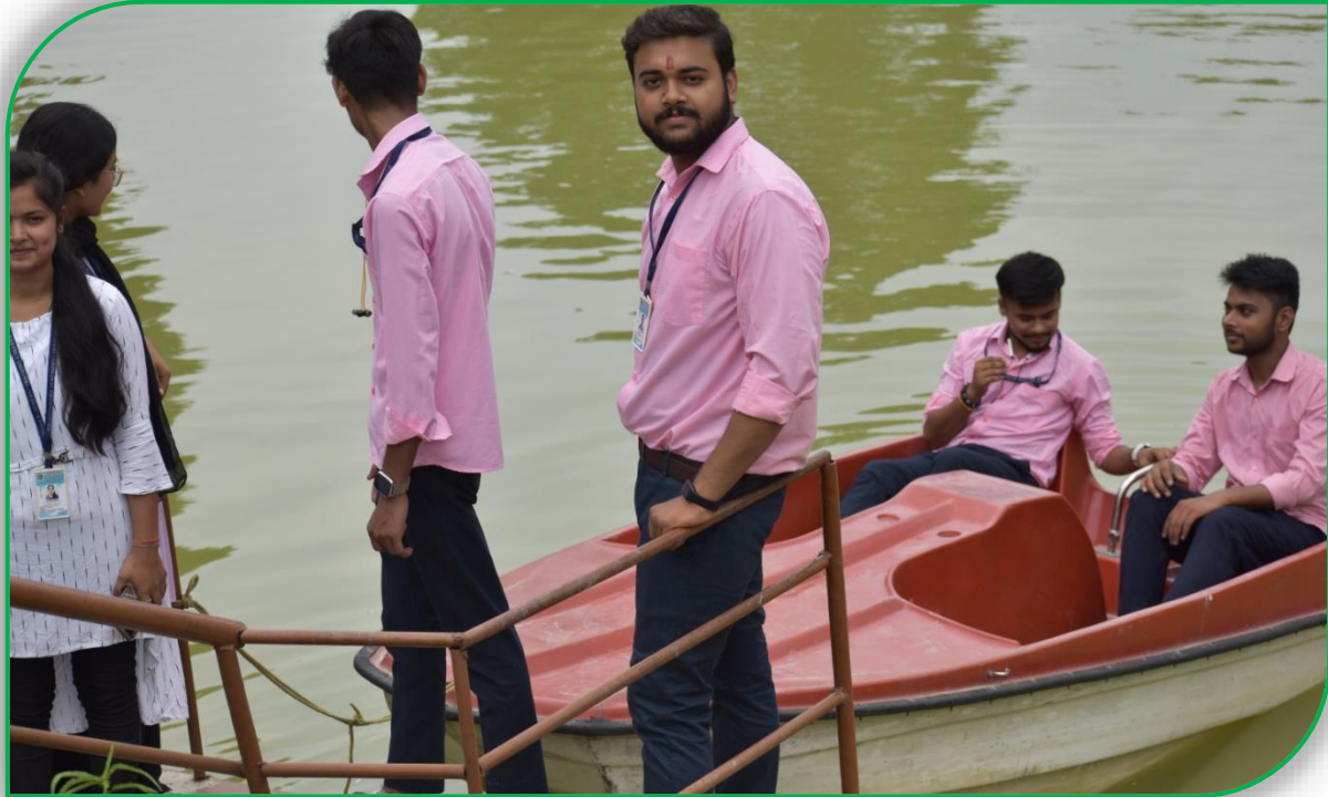
Students enjoying boating, Pusa on dated 17.04.2023

Inside this Botanical garden, there is boating facility was also available. They did boating and enjoyed a lot.