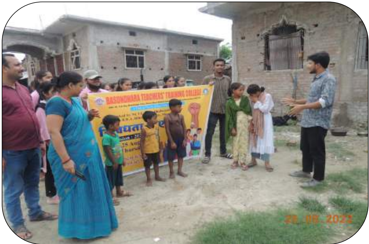
Students interacting with villagers during awareness rally programme on 25-08-2022