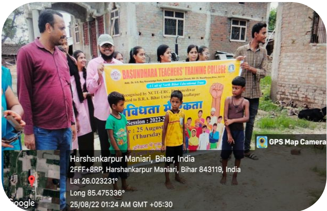
Students and faculty during rally on 25-08-2022