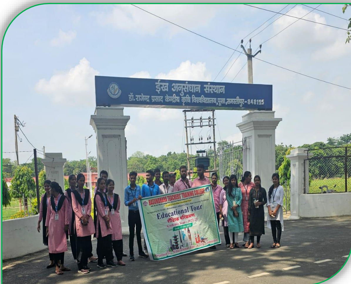
Students visiting Sugarcane Research Institute Pusa on dated 17.04.2023

In the field of University they have seen different species & varieties of mangoes, which they have developed.