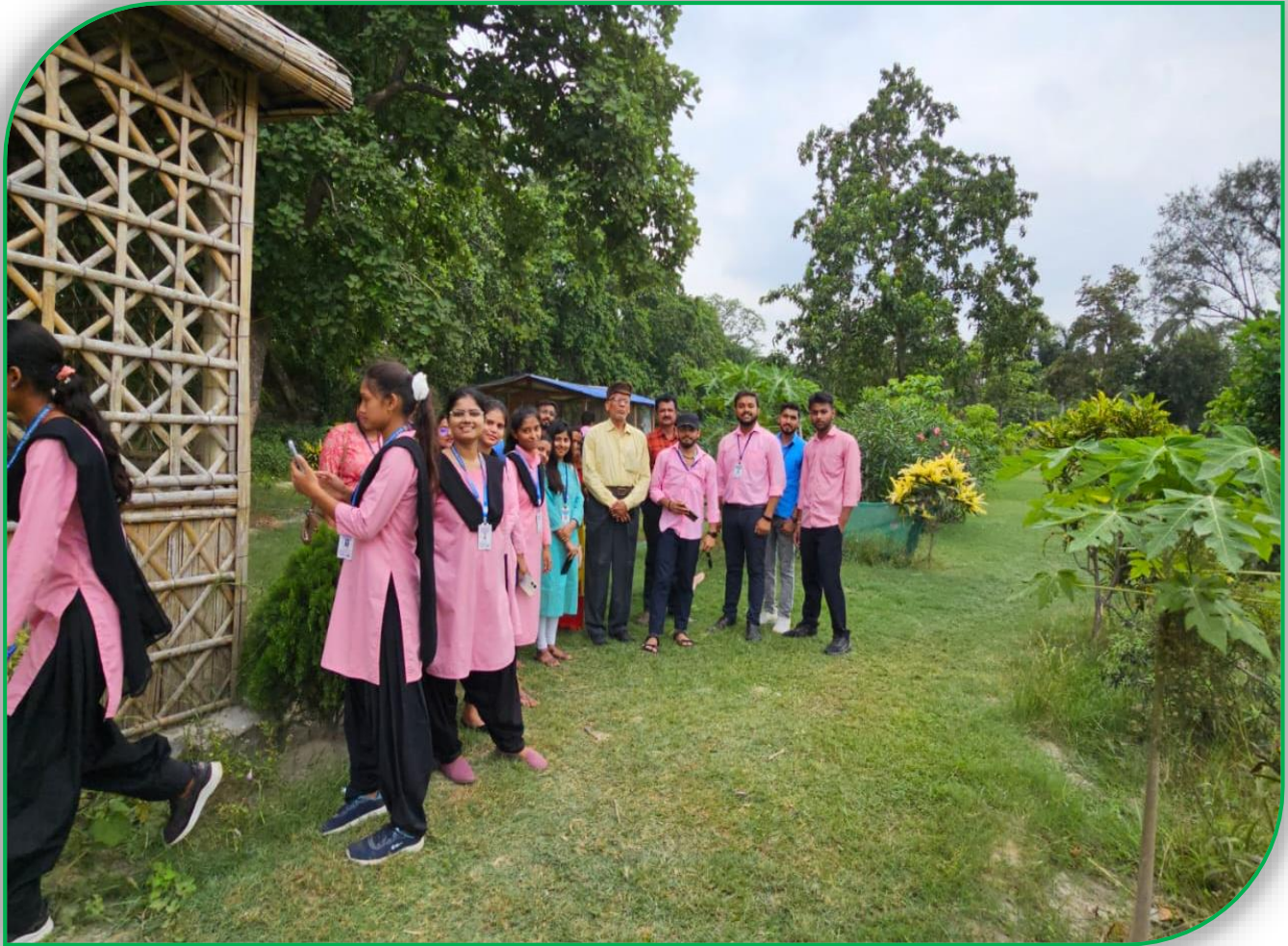
Students getting information about Mushroom harvesting at University campus Pusa on dated 17.04.2023

After that they went to visit the Dr. S. N. Sinha Library . There were a big library where more than thousand of books found. All books are very useful in the field of agriculture and all of different writer and publication.