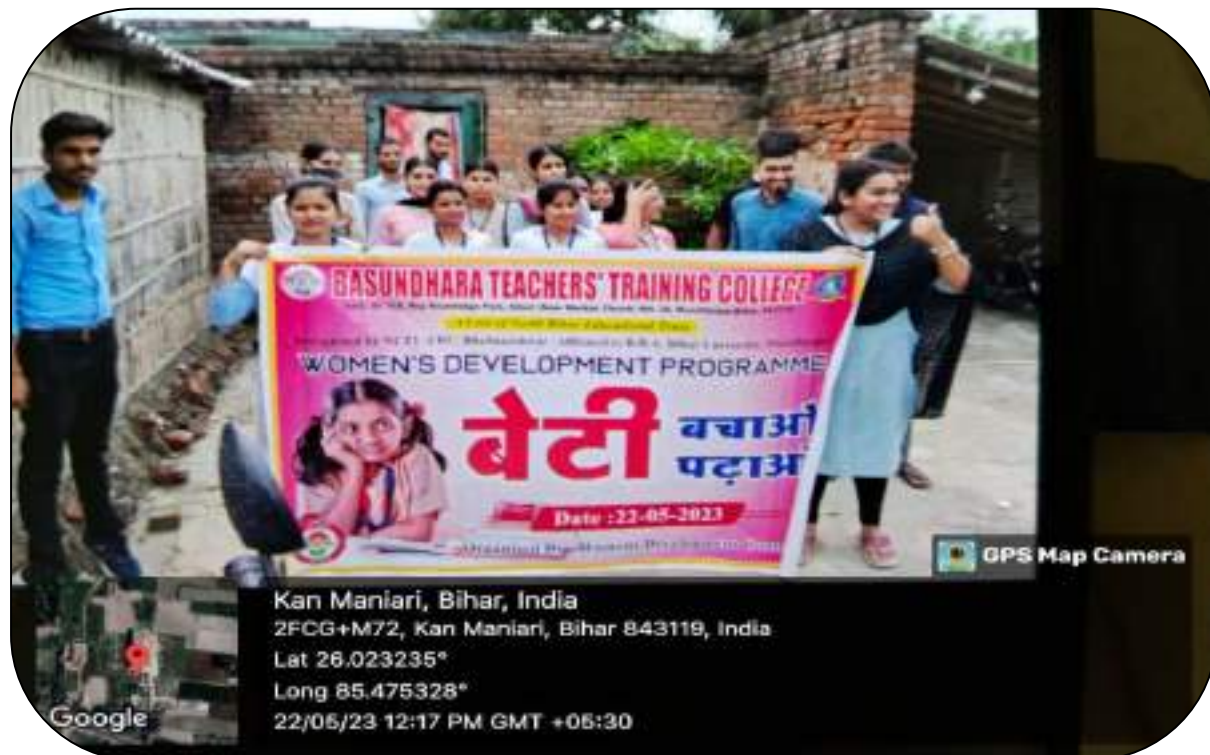
Students During awareness rally programme May 22, 2023