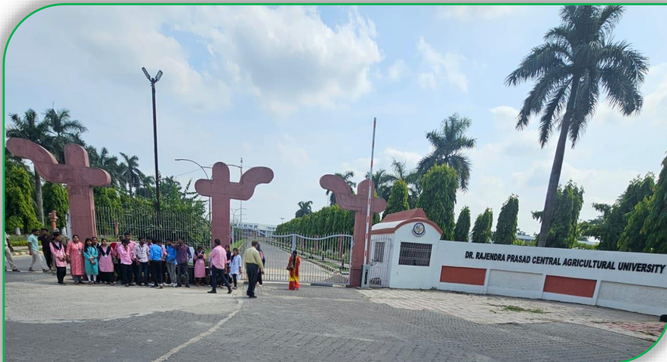
Main Entrance gate of Dr. Rajendra Prasad Central Agricultural University, Pusa on dated 17.04.2023

Guide of these guided and told about the special Character of the rare species of plants. Inside these lots of beautiful flowers was also found. Specially, Rose garden was so much exciting so many colors of beautiful roses are available there. They feel very happy to saw this.