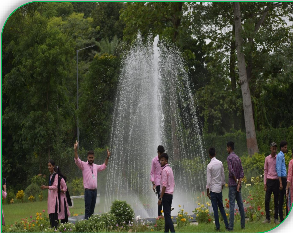
Students visiting Sugarcane Research Institute Pusa on dated 17.04.2023

At last they have visited main building of this University where Vice-chancellor and all officials of the University is sitting. It looks very attractive and well maintained.