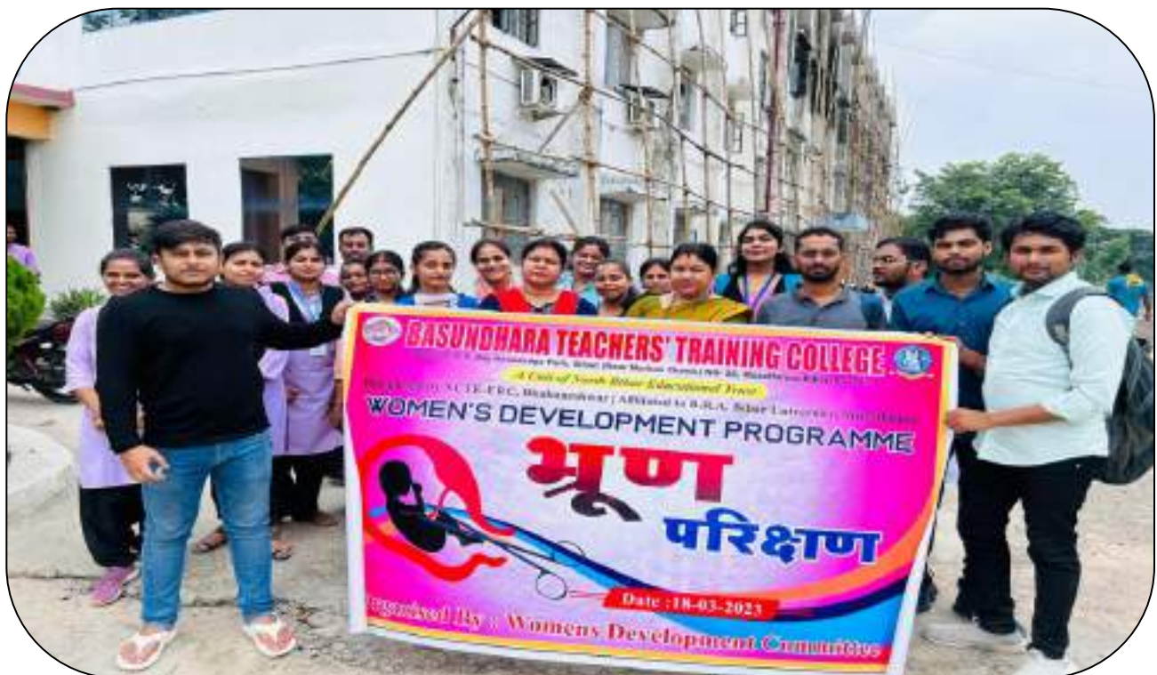
Students and faculty just before rally on March 18, 2023

Today on March 18, 2023, Basundhara Teacher Training College (BTTC) organized an impactful rally to raise awareness about embryo testing, its ethical considerations, and its implications. The rally, lead by the BTTC, aimed to educate the community on the significance of ethical practices in medical procedures and the importance of informed decision-making. The rally began at the BTTC gate and proceeded to the nearby village, with active participation from students, faculty members and local residents. The rally commenced at 10:00 AM from the BTTC gate. Participants assembled early, carrying banners, placards, and informational materials on embryo testing and ethical medical practices. Dr. Sheo Prakash Dwivedi, the Principal of BTTC, inaugurated the event with an enlightening speech that emphasized the importance of understanding the ethical dimensions of medical technologies and the role of education in promoting informed choices.