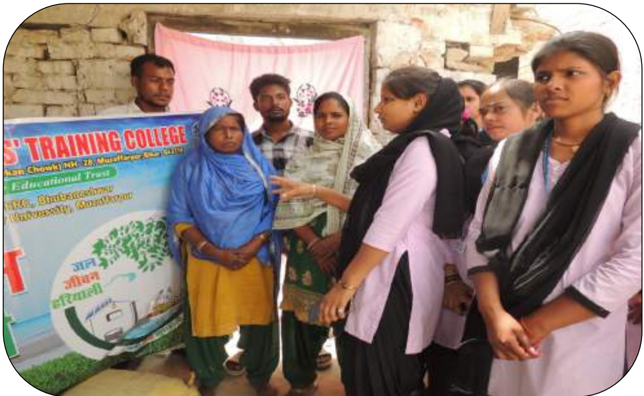
Students making awareness around villages for Save Water 28-02-2023