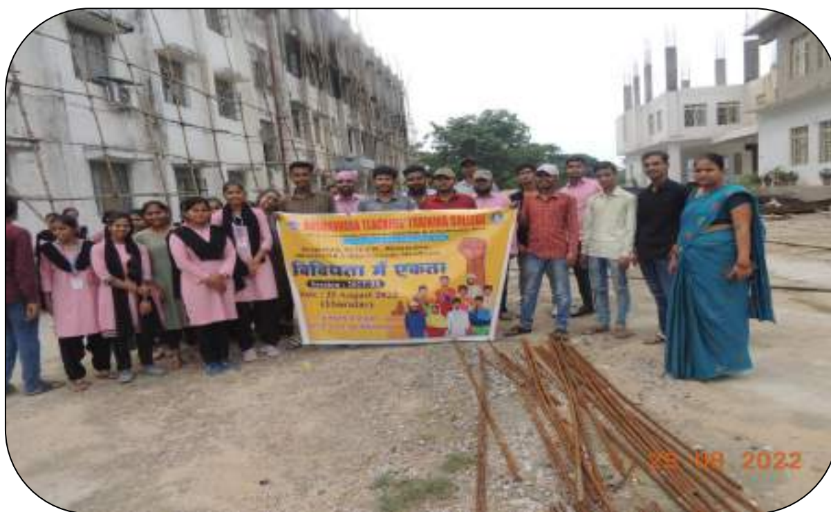
Students and faculty during rally event 25-08-2022