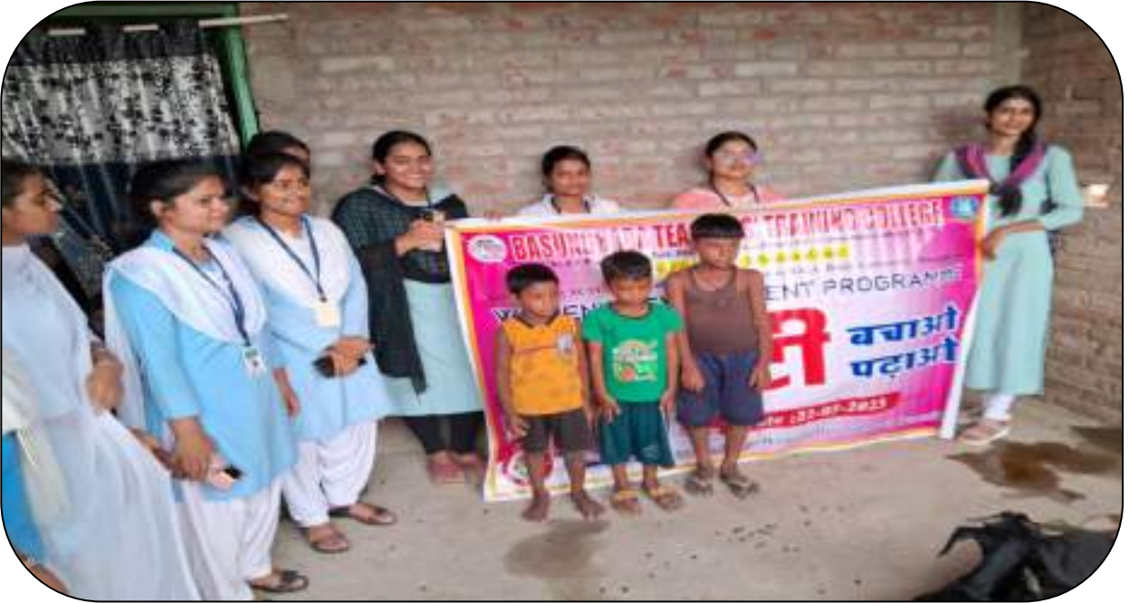
Peoples getting knowledge about “Beti Bachao Beti Padhao” through this awareness programme. May 22, 2023

Faculty members delivered speeches highlighting the significance of educating girls, the challenges faced by girls in accessing education, and the positive impact of empowered women on society. Their speeches were motivating and provided valuable insights into the importance of gender equality.