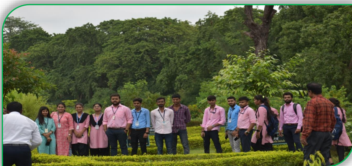
Students enjoying themselves at Botanical Garden, Pusa on dated 17.04.2023

Guide of these guided and told about the special Character of the rare species of plants. Inside these lots of beautiful flowers was also found. Specially, Rose garden was so much exciting so many colors of beautiful roses are available there. They feel very happy to saw this.