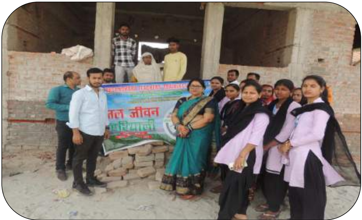
Students making awareness around villages for awareness rally 28-02-2023